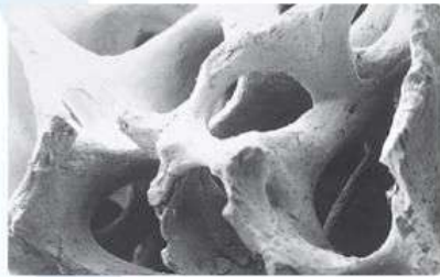
4. Purified bone