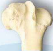
2. Consistent bone parts