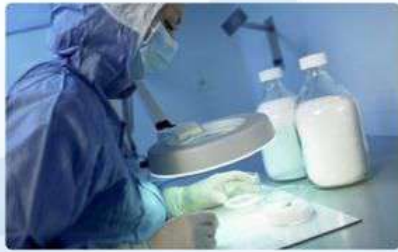
5. Visual control

OUTSTANDING QUALITY – GEISTLICH CONTROLS THE WHOLE VALUE CHAIN. FROM A – Z: THE WHOLE PRODUCT KNOWLEDGE IS IN OUR HANDS