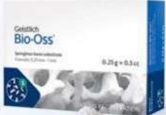
7. Consistent high quality products