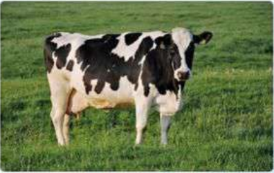
1. Individually controlled animals