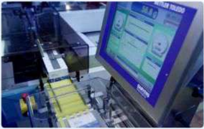
6. Made in Switzerland